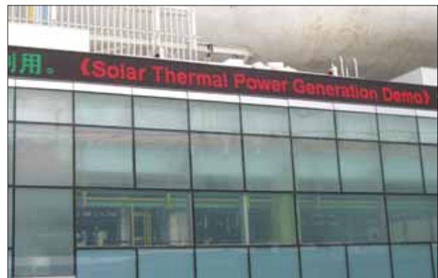
Fig 1 - Solar thermal Kalina Cycle® power plant demonstration - EXPO 2010 Shanghai, China.

The Kalina Cycle® power plant installed at the Corporate Pavilion will operate for the duration of EXPO 2010 (31 st of October), and will then be relocated to an alternative site to again demonstrate the unique efficiencies of the technology.