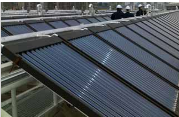
Fig 4 - Solar thermal array installed on the roof of the Shanghai Corporate Pavilion by SSNE.