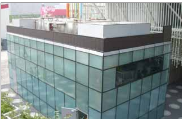
Fig 5 - Solar thermal Kalina Cycle® power plant demonstration - EXPO 2010 Shanghai, China.