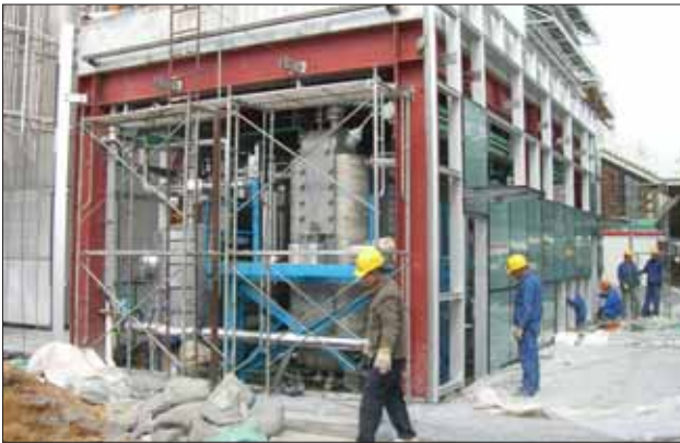
Fig 3 - Construction of solar thermal Kalina Cycle® power plant by SSNE.