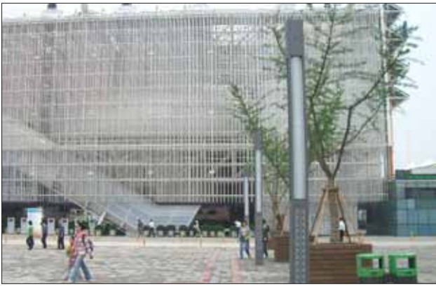
Fig 2 - Shanghai Corporate Pavilion with solar thermal Kalina Cycle® power plant (bottom right) .