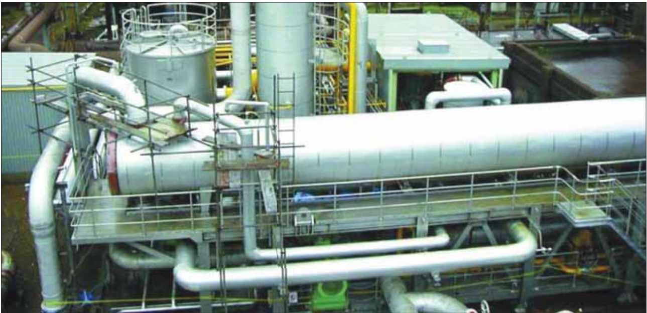
Fig 7 - The 3,450 kW Kalina Cycle® power plant installed at the Kashima Steel Works operated by Sumitomo Metals. The Kalina Cycle® power plant has been successfully operating since September 1999.